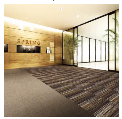
DC-1101 / GX-3014