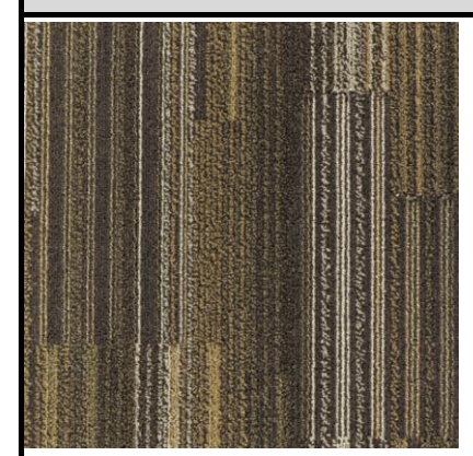
DC-11013 colorways available